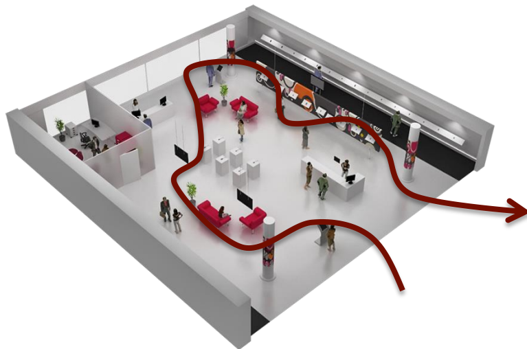
Fig 1. Understanding and managing the customer journey is key in delivering improved customer experience in retail.

So how can Customer Experience Management (CEM) and Customer Flow Management (CFM) methodologies turn these challenges into opportunities – enhancing the customer experience, whilst improving your bottom line?