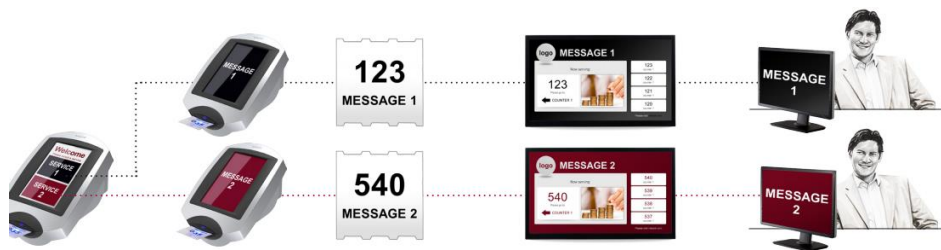
Fig 2. Qmatic Customer Journey gives a store control of all the surfaces in the branch and not just the big screens on the wall as typical Digital Signage suppliers.

For example, you can exploit commercial opportunities by implementing effective media solutions at strategic locations and stages of the customer journey, whilst the virtual queuing solution maximises the opportunity for customers to browse whilst they wait for service.